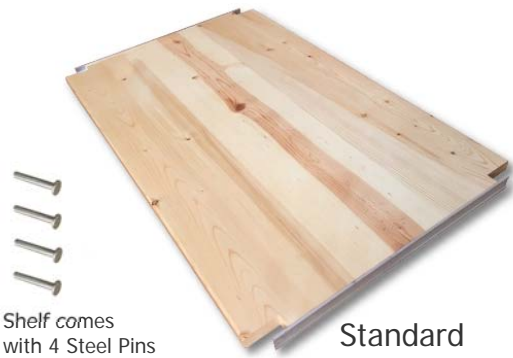
Shelf comes with 4 Steel Pins