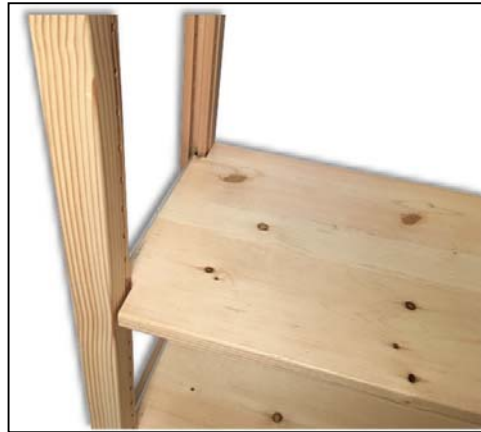
The metal bar on the end of each side of the shelf will rest flat on steel pins.