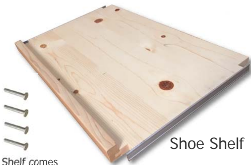
Shelf comes with 4 Steel Pins