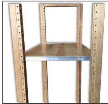
Height is adjustable in 1" increments.