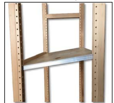
Set pin in back 2" higher than pin in front. Shoe shelf cannot be angled any more than this.

Questions? Call us Toll Free in US: (888) 989-1370 Monday - Friday, 8:30 - 5:00 Pacific Standard Time