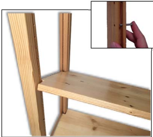
Insert 4 Steel Pins in Upright Holes to support shelf. Slide shelf into upright.