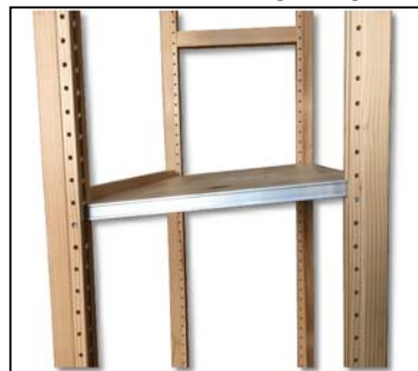
Set pin in back 1" higher than pin in front